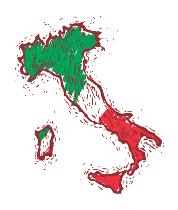
Buona festa della mamma Happy Mother's Day!