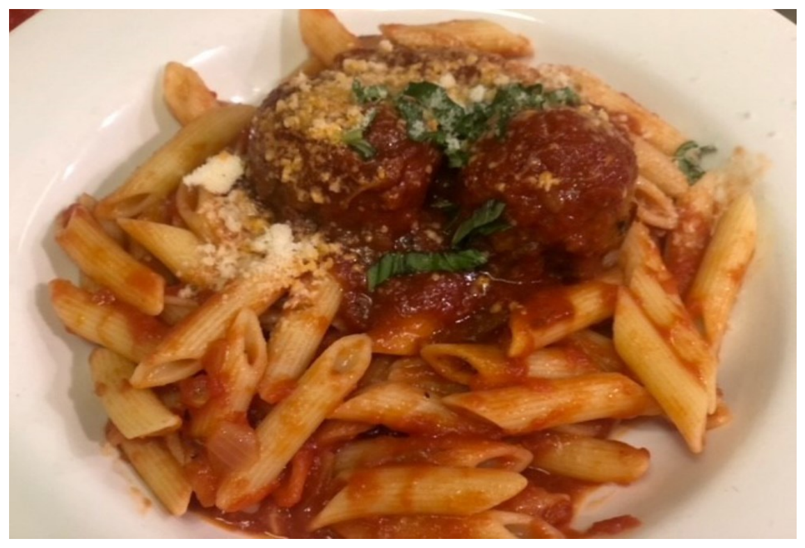
Tickets available at the door.

Meal includes Italian Salad, Bread & Butter